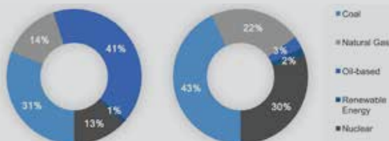
Energy generation by source South Korea

"Designed to meet rising demand for electricity from South Korea's expanding